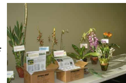
A Few of the Live Auction Orchids