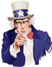
AOL Needs YOU!!