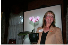
Linda Tripp Shares