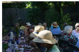
Great BBQ, Gorgeous Day, Fun for All